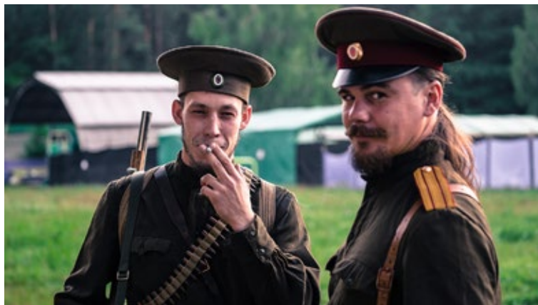
Russian soldiers with the train station and Land of the Dead in the background.

The game had a well working economy. The fact that there were so many things to spend in-game money on meant that all players had good reasons to try to get and hold on to money. The bills and all kinds of paperwork, of which there were huge amounts, were of high quality. After the first larp day there started to be inflation, a planned design feature from the GMs, which escalated through the participants. The economy was not only a fun plot driver, it was essential for the political enactment.